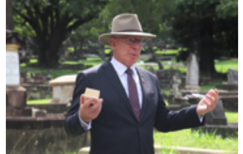
His Excellency the Honourable David John Hurley AC DSC.