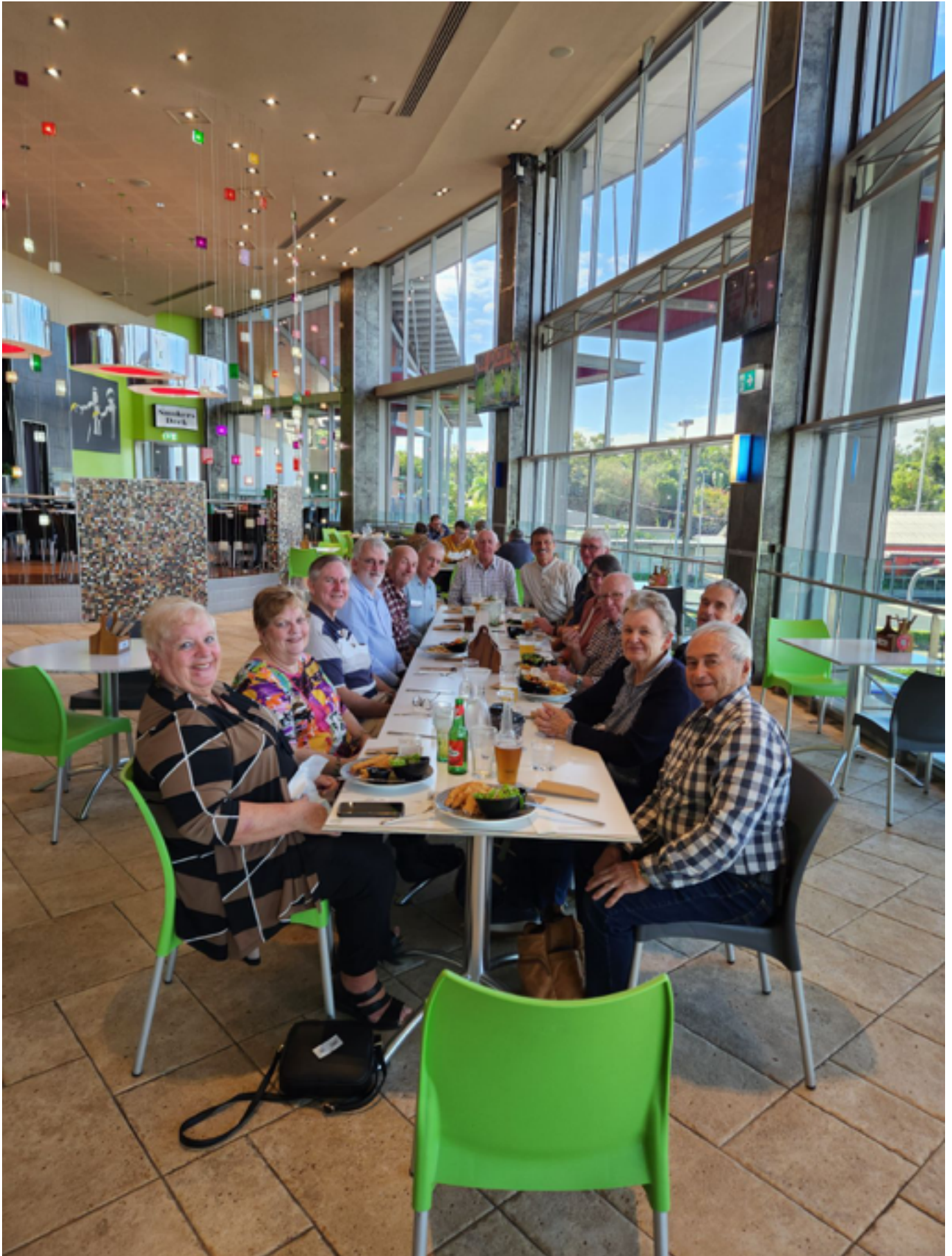
Pictured L to R: Luncheon at the Caloundra RSL