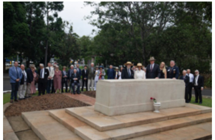
Stone of Remembrance