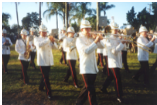
QUR Band Anzac Day 2001