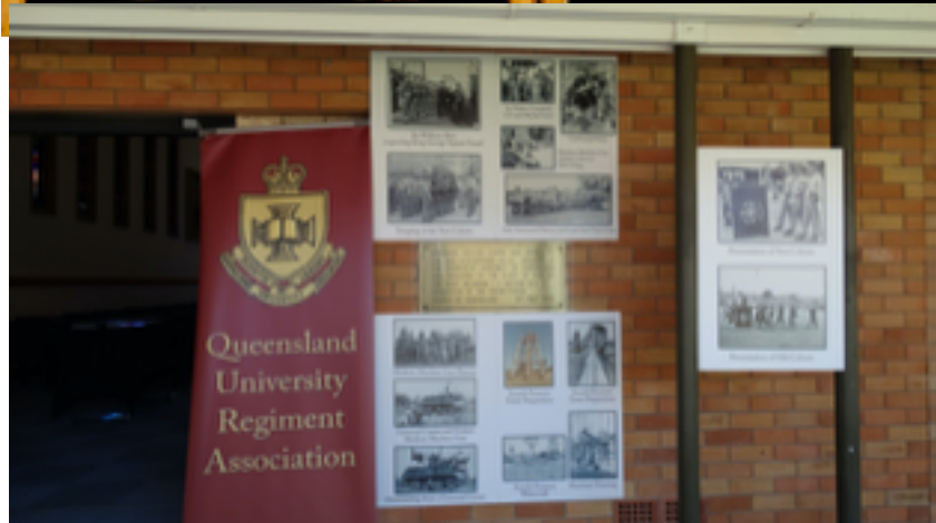
Display of the history of QUR on the outside front wall of the Chapel.