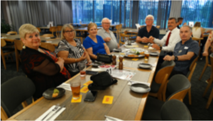
LHS to RHS