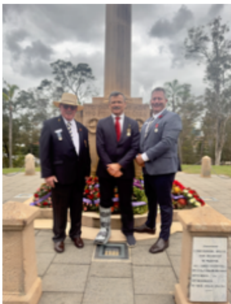
Remembrance Day 2023 from L to R