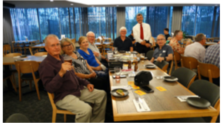
LHS to RHS