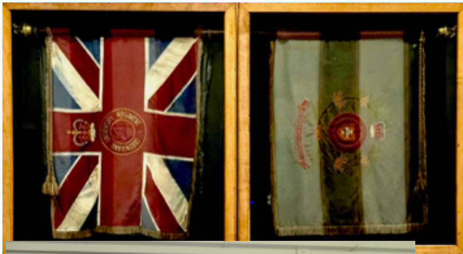
The Queen's and Regimental Colours presented to QUR in 1959.