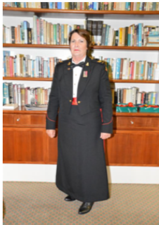
Elona Drain Regimental Dinner 2013