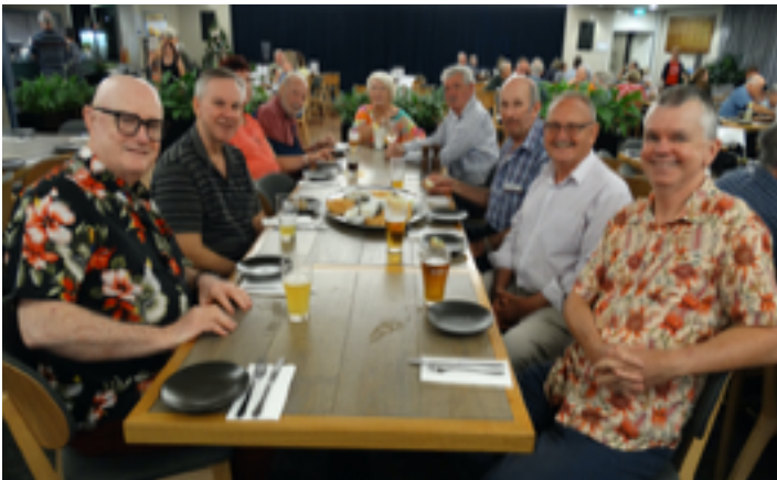
LHS to RHS