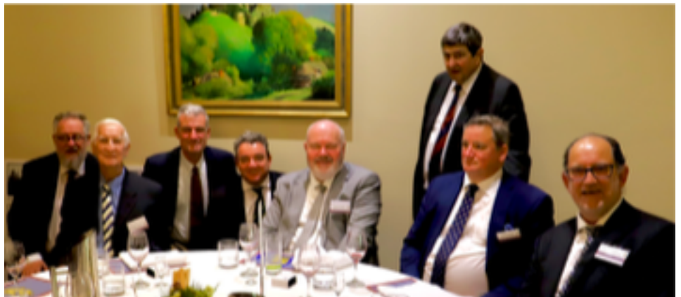
Members of the Legal Fraternity - QURA members