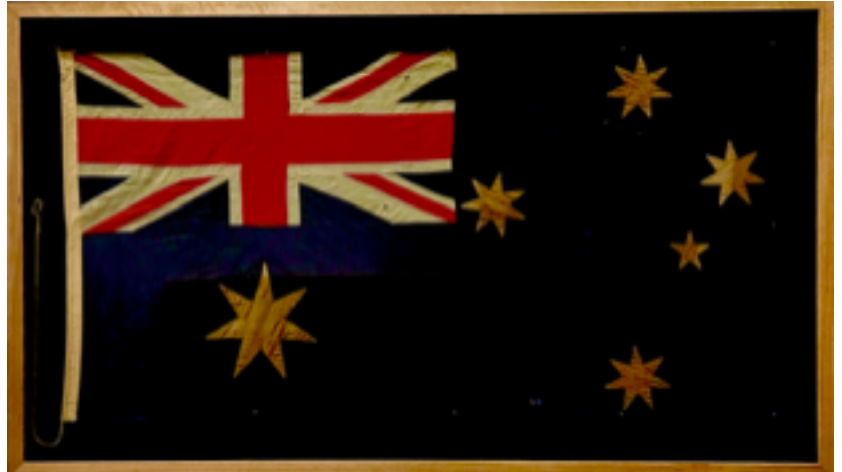
Above: The Merrington Flag.