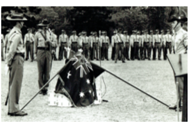
After the old Colours have been marched off, the new Colours are marched onto the parade ground. They are uncased and laid on several drums from the band. "The Piling of the Drums" is a spiritual event and it is known as the "Spititual Altar"