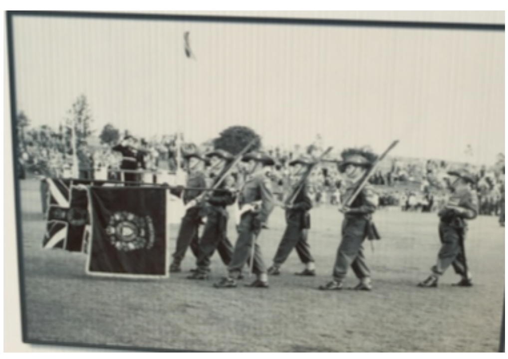
March past with the Colours in slow time 1959.