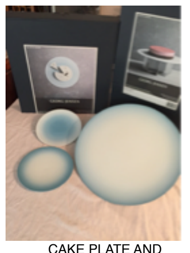
CAKE PLATE AND PASTRY PLATES