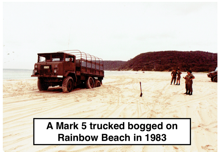
Driver - Bill Beach - He never did learn anything about the beach or the water.